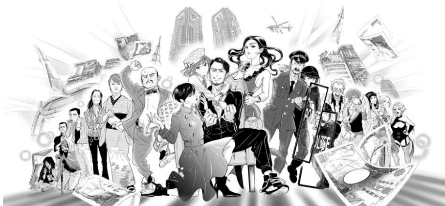
Main visual of " The Threepenny Opera ", illustration: IWABUCHI Ryuko

Just don't be too surprised if you find all kinds of absurdities from contemporary life here, too — including humans' insatiable desire, hunger for power and social divisions..