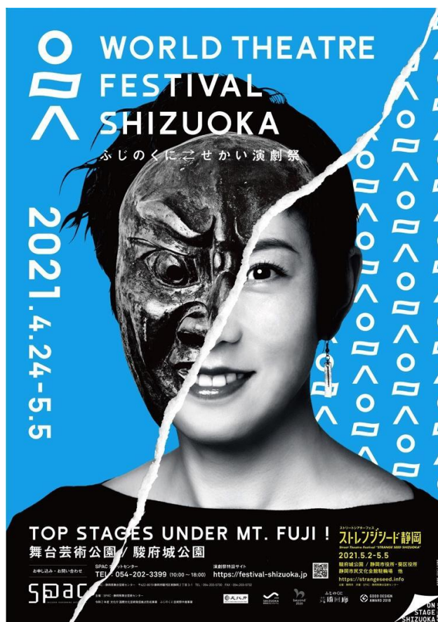
Main visual of Guide brochure HONDA Maki (SPAC), photo by KATO Takashi

at Shizuoka Performing Arts Park, Sumpu Castel Park and more